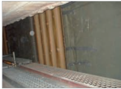
Figure 2 Catalytic tubes covered with paper before application