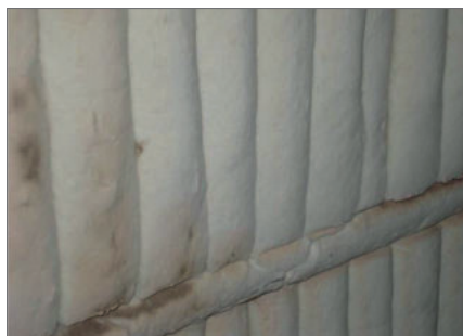
Figure 1 Refractory surface before sandblasting