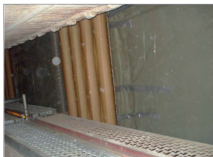
Figure 2 Catalytic tubes covered with paper before application