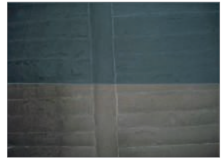
Figure 3 Refractory surface after application

application. Burner mouths are closed with planks, and it is ensured that no dust or chemicals get into them. The existing refractory surface has been sandblasted to obtain a smooth surface on which the coating will adhere.