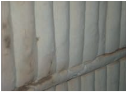
Figure 1 Refractory surface before sandblasting